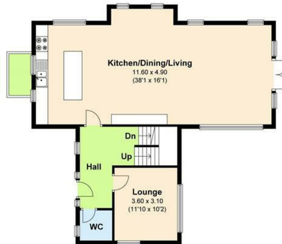
Ground Floor Approx. 86.70 sq. metres (933.24 sq. feet)