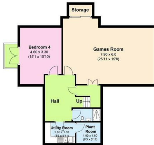
Basement Approx. 86.20 sq. metres (927.84 sq. feet)